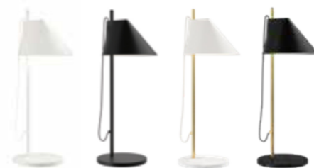
Yuh Table Design: GamFratesi Finish: White or Black, matt wet painted. Clear lacquered, brushed brass. Matt marble, brushed. Fitted with build-in LED light unit. 2700K