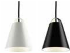
Above Design: Mads Odgård Finish: White or Black. Matt, wet painted.