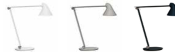
NJP Table Design: nendo Finish: White, Light Alu Grey or Black, powder coated. Fitted with build-in LED light unit. 2700K.

Height 480mm: With pin Ø10mm Height 480mm: With pin Ø40mm Height 480mm: With base plate Height 480mm: With clamp