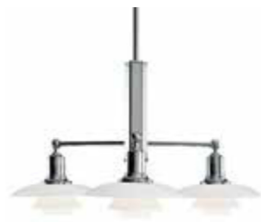
PH 2/1 Stem Fitting Design: Poul Henningsen Finish: High lustre chrome plated. White opal glass. Ø596mm