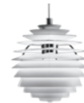
PH Louvre Design: Poul Henningsen Finish: Wet-painted white. Fitted with build-in LED light unit 2700K.