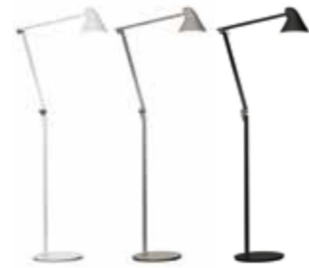
NJP Floor Design: nendo Finish: White, Light Alu Grey or Black, powder coated. Fitted with build-in LED light unit. 2700K.