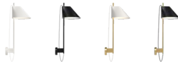
Yuh Wall Design: GamFratesi Finish: White or Black, matt wet painted. Clear lacquered, brushed brass. Fitted with build-in LED light unit. 2700K.