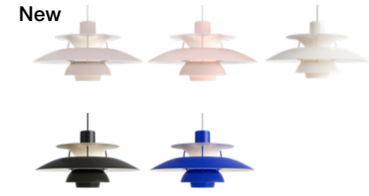
PH 5 Monochrome Design: Poul Henningsen Finish: Monochrome Oyster Grey, Monochrome Pale Rose, Monochrome White, Monochrome Black and Monochrome Blue. Matt wet painted. Ø500mm