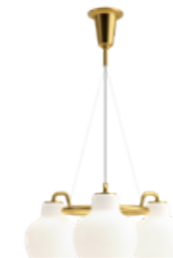
VL Ring Crown 3 Design: Vilhelm Lauritzen Finish: Glossy, white opal glass. Satin polished brass, untreated.