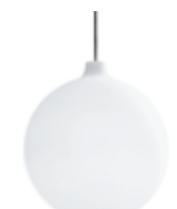
Wohlert Design: Vilhelm Wohlert Finish: Matt white opal glass.