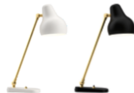
VL38 Table Design: Vilhelm Lauritzen Finish: White or Black, powder coated. Brushed brass, untreated. Fitted with build-in LED light unit. 2700K.