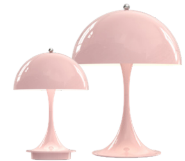
Pantella Portable/MINI Design: Verner Panton