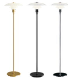
PH 3 1/2-2 1/2 Floor Design: Poul Henningsen Finish: Brass metallised, black metallised or high lustre chrome plated. White opal glass.