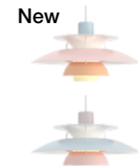
PH 5 Pastels Design: Poul Henningsen Finish: Blue, Rose, Peach and Yellow. Oyster Grey, Blue, Rose and Yellow. Matt wet painted. Ø500mm