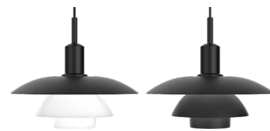
PH 5/5 Pendant Design: Poul Henningsen Finish: Black metal, or black metal with glass.