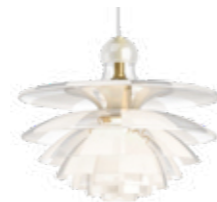
PH Septima Design: Poul Henningsen Finish: Clear glass with sandblasted fields. Satin polished brass, untreated.