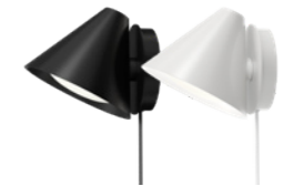
Keglen Wall Design: BIG Ideas Finish: Black or white. Matt, wet painted. Fitted with built-in LED light unit. 2700K.