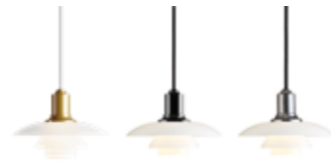
PH 2/1 Pendant Design: Poul Henningsen Finish: Brass metallised, black metallised or high lustre chrome plated. White opal glass. Ø200mm