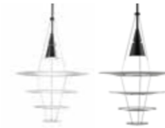
Enigma 425 Design: Shoichi Uchiyama Finish: Aluminium, brushed and clear coated with matt white acrylic shades. Aluminium, brushed and black coated with matt black acrylic shades.