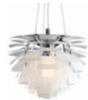
PH Artichoke Glass Design: Poul Henningsen Finish: Clear glass, sandblasted