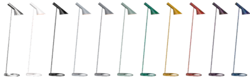
AJ Floor Design: Arne Jacobsen Finish: Stainless Steel, polished. White, Black, Light Grey, Dark Grey, Pale Petroleum, Dark Green, Yellow Ochre, Rusty Red, Aubergine, Midnight Blue, wet painted.