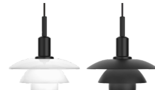
PH 3/3 Pendant Design: Poul Henningsen Finish: Black metal, or black metal with glass. Ø 285mm