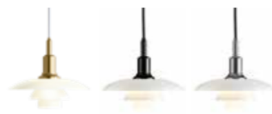
PH 3/2 Pendant Design: Poul Henningsen Finish: Brass metallised, black metallised or high lustre chrome plated. White opal glass. Ø290mm