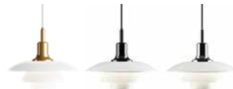
PH 3½-3 Glass Pendant Design: Poul Henningsen Finish: Brass metallised, black metallised or high lustre chrome plated. White opal glass. Ø330mm