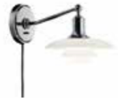
PH 2/1 Wall Design: Poul Henningsen Finish: High lustre chrome plated. White opal glass.