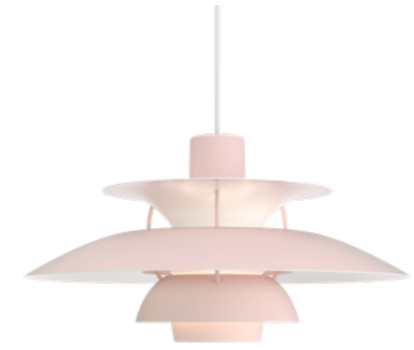
PH 5 Monochrome Design: Poul Henningsen