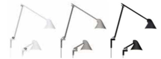
NJP Wall Design: nendo Finish: White, Light Alu Grey or Black, powder coated. Fitted with build-in LED light unit. 2700K.