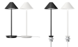
Keglen Table Design: BIG Ideas Finish: Black or white. Matt, wet painted. Fitted with built-in LED light unit. 2700K.