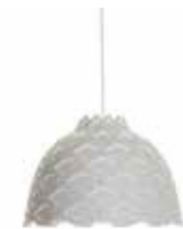
LC Shutters Design: Louise Campbell Finish: White, powder coated.