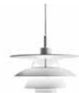
PH 5-4½ PH 6½-6 Design: Poul Henningsen Finish: Wet-painted white.