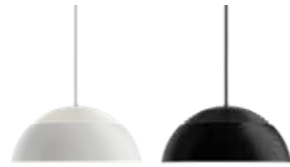
AJ Royal Design: Arne Jacobsen Finish: White or Black, wet painted. Fitted with build-in LED light unit. 2700K.