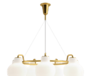
VL Ring Crown 7 Design: Vilhelm Lauritzen Finish: Glossy, white opal glass. Satin polished brass, untreated.