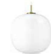
VL45 Radiohus Pendant Design: Vilhelm Lauritzen Finish: Glossy white opal glass. Brushed brass, untreated.