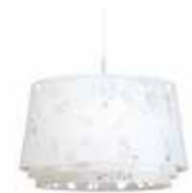
Collage Design: Louise Campbell Finish: White matt.