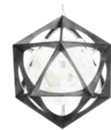
OE Quasi Light Design: Olafur Eliasson Finish: Clear lacquered, pickled aluminium. Matt white reflector. Fitted with build-in LED light unit. 2700K.