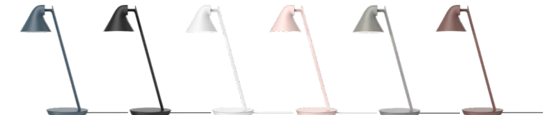
NJP Table Mini Design: nendo Finish: Petrol Blue, Black, White, Soft Pink, Light Alu Grey, or Taupe. Fitted with build-in LED light unit. 2700K.

Height 480mm: With pin Ø10mm Height 480mm: With pin Ø40mm Height 480mm: With base plate Height 480mm: With clamp