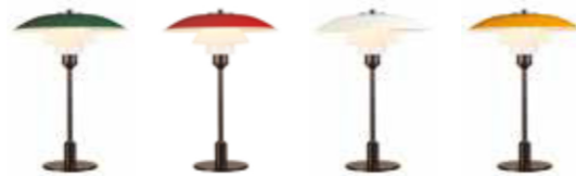
PH 3½-2½ Table Design: Poul Henningsen Finish: Green, Red, White or Yellow, powder coated.