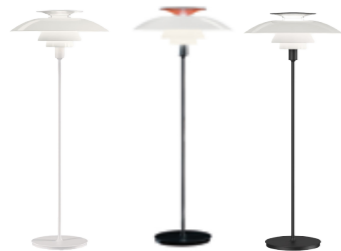
PH 80 Design: Poul Henningsen Finish: White opal acrylic. White. Black. High lustre chrome plated.