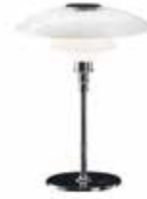
PH 4½-3½ Glass Table Design: Poul Henningsen Finish: High lustre chrome plated. White opal glass.