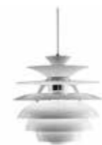
PH Snowball Design: Poul Henningsen Finish: Wet-painted white.