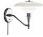
PH 3/2 Wall Design: Poul Henningsen Finish: High lustre chrome plated. White opal glass.