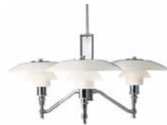
PH 3/2 Academy Design: Poul Henningsen Finish: High lustre chrome plated. White opal glass. Ø680mm