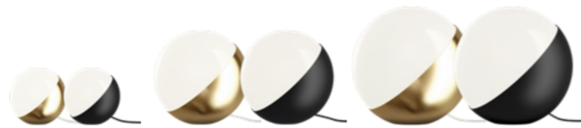
VL Studio Table/Floor Design: Vilhelm Lauritzen Finish: Matt black, wet painted or brushed brass with fine hairlines. White opal glass, glossy.