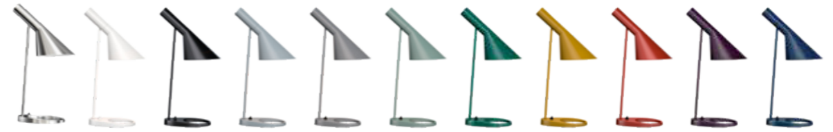
AJ Table Design: Arne Jacobsen Finish: Stainless Steel, polished. White, Black, Light Grey, Dark Grey, Pale Petroleum, Dark Green, Yellow Ochre, Rusty Red, Aubergine, Midnight Blue, wet painted.