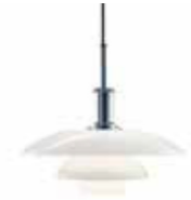
PH 4½-4 Glass Pendant Design: Poul Henningsen Finish: High lustre chrome plated. White opal glass. Ø450mm