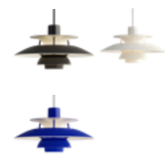
PH 5 Mini Monochrome Design: Poul Henningsen Finish: Monochrome Black, Monochrome Blue, Monochrome White, Matt wet painted. Ø300mm