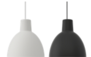
Toldbod 400/550 Pendant Design: Louis Poulsen A/S Finish: White or Black. Matt powder coated.