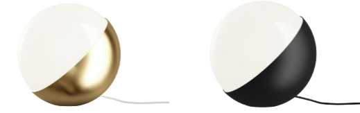
VL Studio Table Design: Vilhelm Lauritzen Finish: Brass. Black.