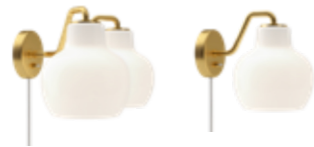
VL Ring Crown Wall Lamp Design: Vilhelm Lauritzen Finish: Glossy, white opal glass. Satin polished brass, untreated.