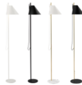
YUH Floor Design: GamFratesi Finish: White or Black, matt wet painted. Clear lacquered, brushed brass. Matt marble, brushed. Fitted with build-in LED light unit. 2700K.