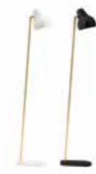
VL38 Floor Design: Vilhelm Lauritzen Finish: White or Black powder coated. Brushed brass, untreated. Fitted with build-in LED light unit. 2700K.