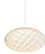
Patera Oval Design: Øivind Slaatto Finish: Matt white. Ø 500mm