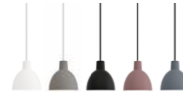
Toldbod 120/170/250 Pendant Design: Louis Poulsen A/S Finish: White, light grey, black, dark rose, blue-grey. Matt powder coated.