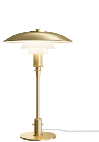
PH limited edition PH 3/2 Limited Edition Table Brass Opal Glass Design: Poul Henningsen