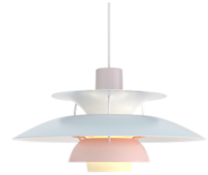
PH 5 Pastels Design: Poul Henningsen