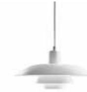
PH 4/3 Pendant Design: Poul Henningsen Finish: White, powder coated. Ø400mm