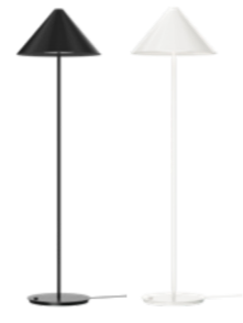
Keglen Floor Design: BIG Ideas Finish: Black or white. Matt, wet painted. Fitted with built-in LED light unit. 2700K.