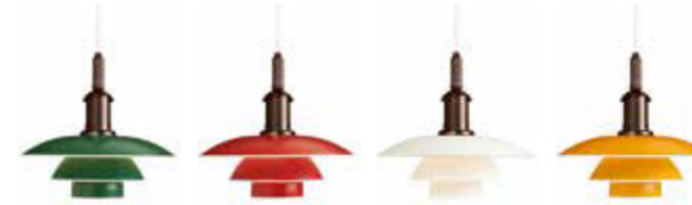
PH 3½-3 Pendant Design: Poul Henningsen Finish: Green, Red, White and Yellow, powder coated. Ø330mm