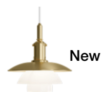
PH 3/3 Limited Edition Pendant Brass Opal Glass Limited Edition 2022 Design: Poul Henningsen Finish: Untreated brushed brass with fine hairlines. White opal glass. Ø285mm