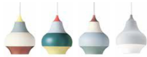
Cirque Design: Clara von Zweigbergk Finish: Yellow top, Red top, Copper top, Grey top, wet painted.