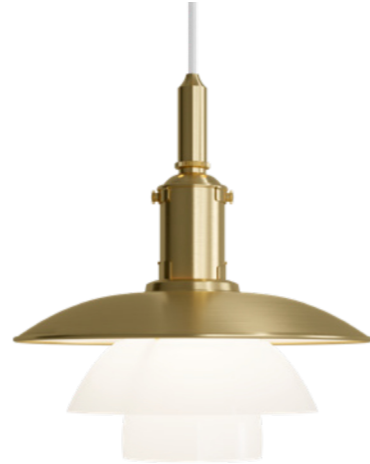
PH limited edition PH 3/3 Limited Edition Pendant Brass Opal Glass Design: Poul Henningsen