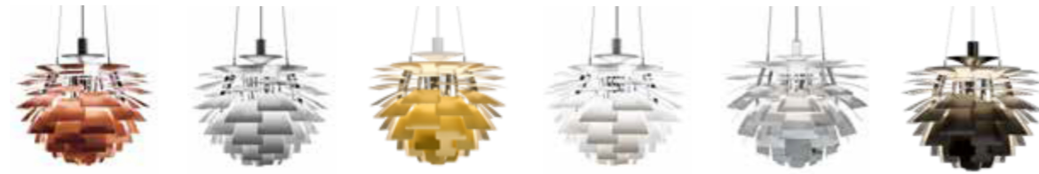
PH Artichoke Design: Poul Henningsen Finish: Copper, stainless steel or brass, brushed and coated. White, wet painted. Polished stainless steel. Black, powder coated with white, wet painted inner side.