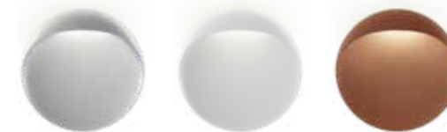
Flindt Wall Design: Christian Flindt Finish: Aluminium coloured, White or Corten coloured. Textured surface, powder coated. Fitted with build-in LED light unit. 2700/3000K.