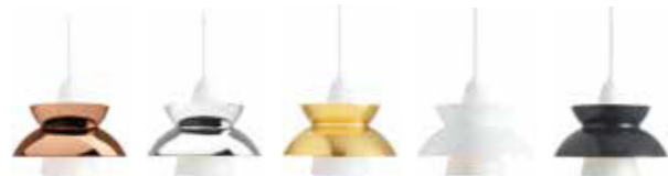
Doo-Wop Design: Louis Poulsen A/S in cooperation with the Navy Buildings Department Finish: Polished Copper, Stainless Steel or Brass. White or Dark grey, powder coated.