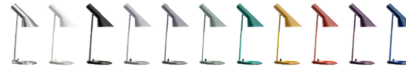
AJ Mini Design: Arne Jacobsen Finish: Stainless Steel, polished. White, Black, Light Grey, Dark Grey, Pale Petroleum, Dark Green, Yellow Ochre, Rusty Red, Aubergine, Midnight Blue, wet painted.