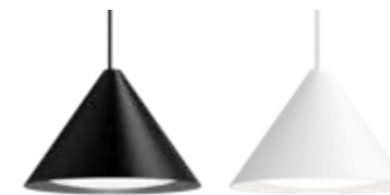
Keglen Design: BIG Ideas Finish: Black or white. Matt, wet painted. Fitted with build-in LED light unit. 2700K.