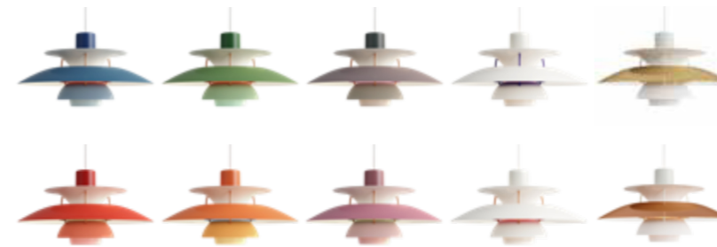
PH 5 Design: Poul Henningsen Finish: Hues of Blue, Green or Grey, matt wet-painted. Classic White, matt powder coated. Untreated polished Brass. Hues of Red, Orange or Rose, matt wet-painted. Modern White, matt powder coated. Untreated polished Copper. Ø500mm