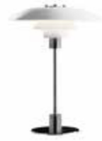
PH 4/3 Table Design: Poul Henningsen Finish: White, powder coated. High lustre chrome plated.