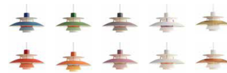
PH 5 Mini Design: Poul Henningsen Finish: Hues of Blue, Green or Grey, matt wet-painted. Classic White, matt powder coated. Untreated polished Brass. Hues of Red, Orange or Rose, matt wet-painted. Modern White, matt powder coated. Untreated polished Copper. Ø300mm