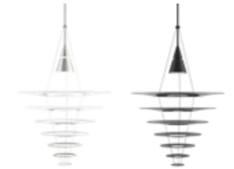
Enigma 825 Design: Shoichi Uchiyama Finish: Wet-painted aluminium-coloured, aluminium with matt white acrylic shades. Wet-painted black, aluminium with matt black acrylic shades. Fitted with build-in LED light unit. 3000K.