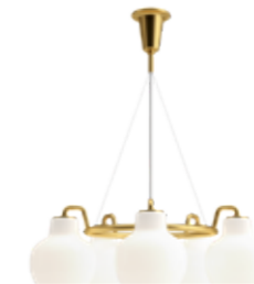
VL Ring Crown 5 Design: Vilhelm Lauritzen Finish: Glossy, white opal glass. Satin polished brass, untreated.