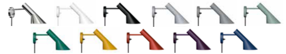
AJ Wall Design: Arne Jacobsen Finish: Stainless Steel, polished. White, Black, Light Grey, Dark Grey, Pale Petroleum, Dark Green, Yellow Ochre, Rusty Red, Aubergine, Midnight Blue, wet painted.